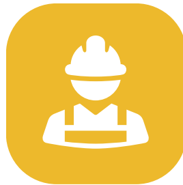
Engineering and Construction