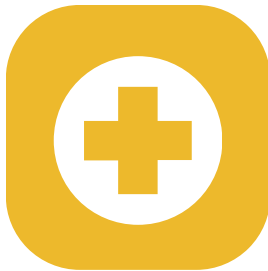
Health, Aged and Social Care